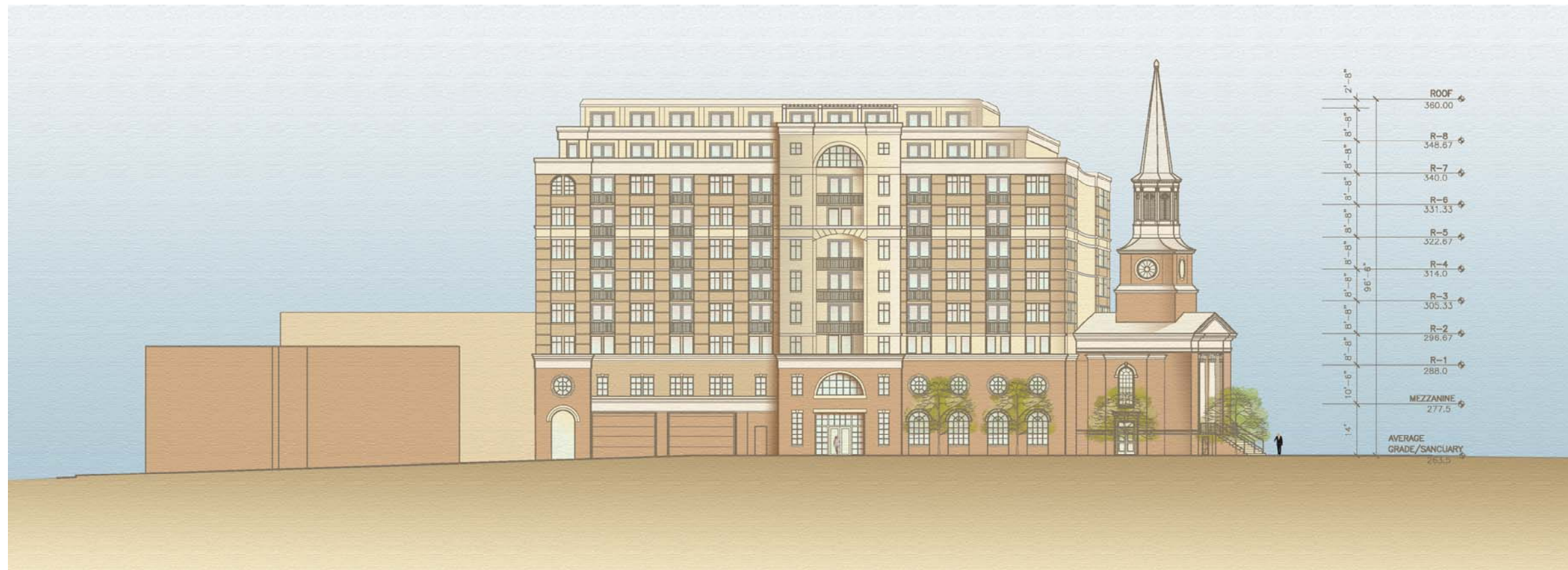
2 WEST ELEVATION 1/16" = 1'-0"