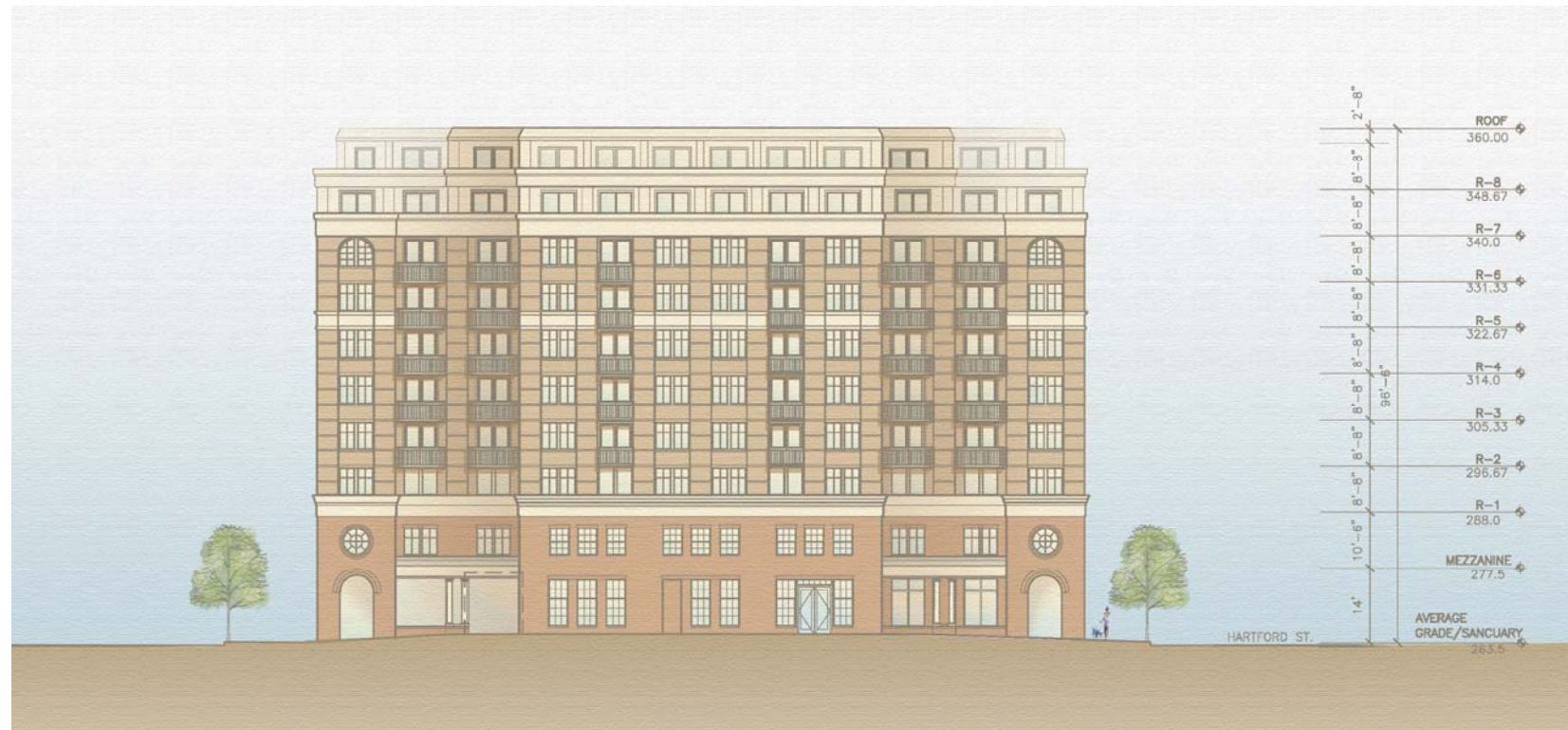
1 NORTH ELEVATION 1/16" = 1'-0"